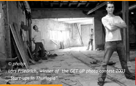
winner of the GET UP photo contest 2003 „Start-ups in Thuringia”